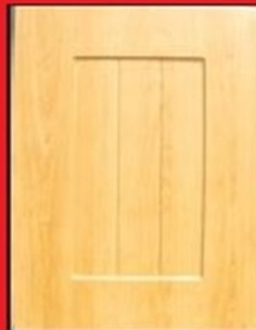
Full Shaker Farmstyle