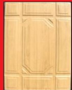
Cottage + Modern